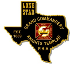
133rd Annual Grand Conclave, Order of the Knights Templar