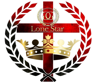
93rd Annual Grand Conclave, Heroines of the Templars