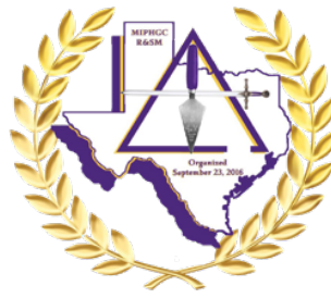
5th Annual Grand Assembly, Royal & Select Masters