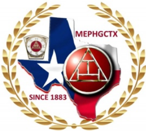
141st Annual Grand Convocation, Holy Royal Arch Mason